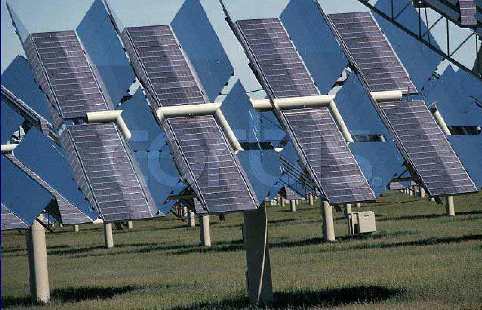
EVA laminated PV panels in V-trough concentrator in Carrisa Plains just after installation