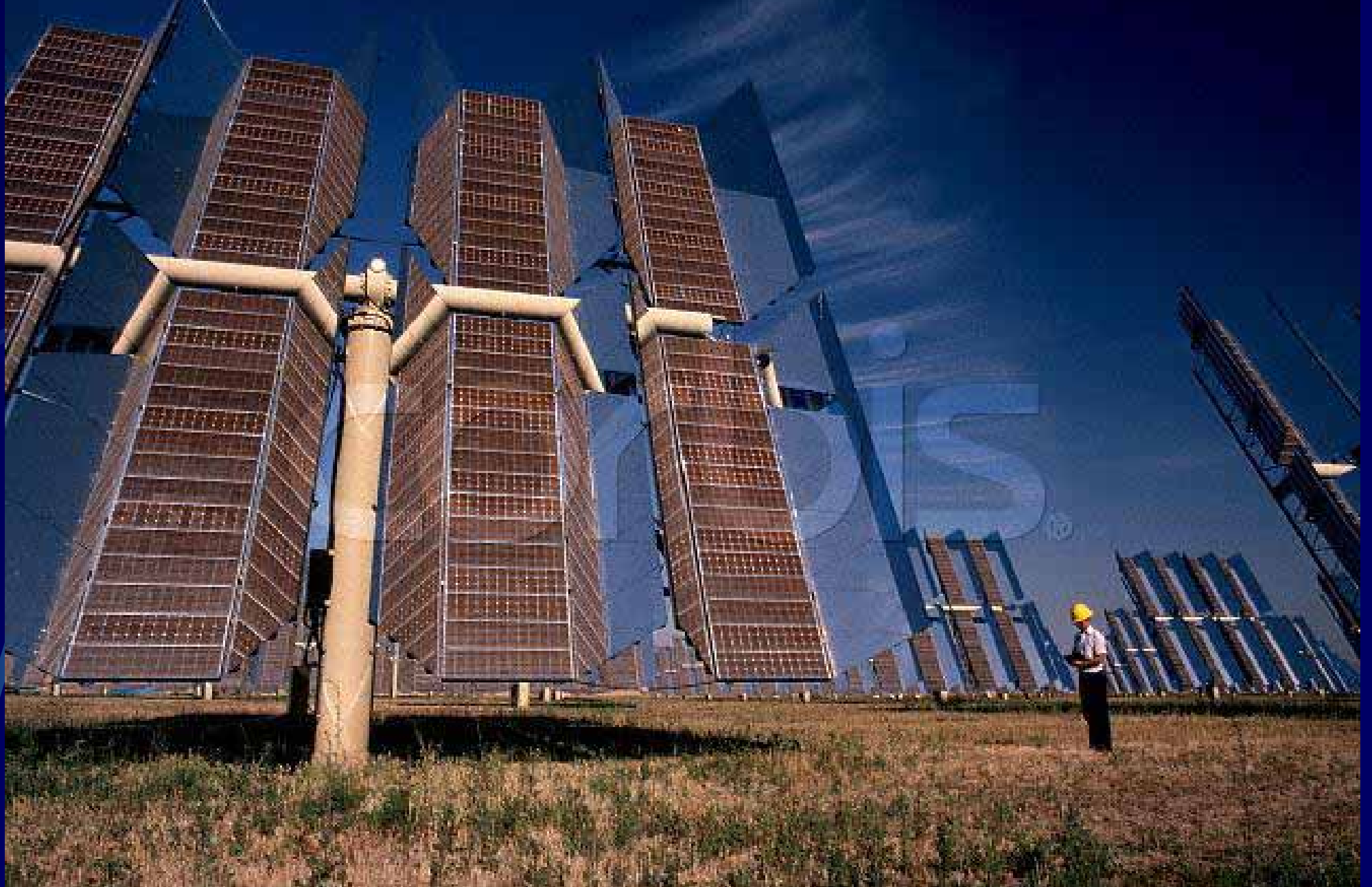
EVA laminated PV panels in V-trough concentrator in Carrisa Plains after 6 months