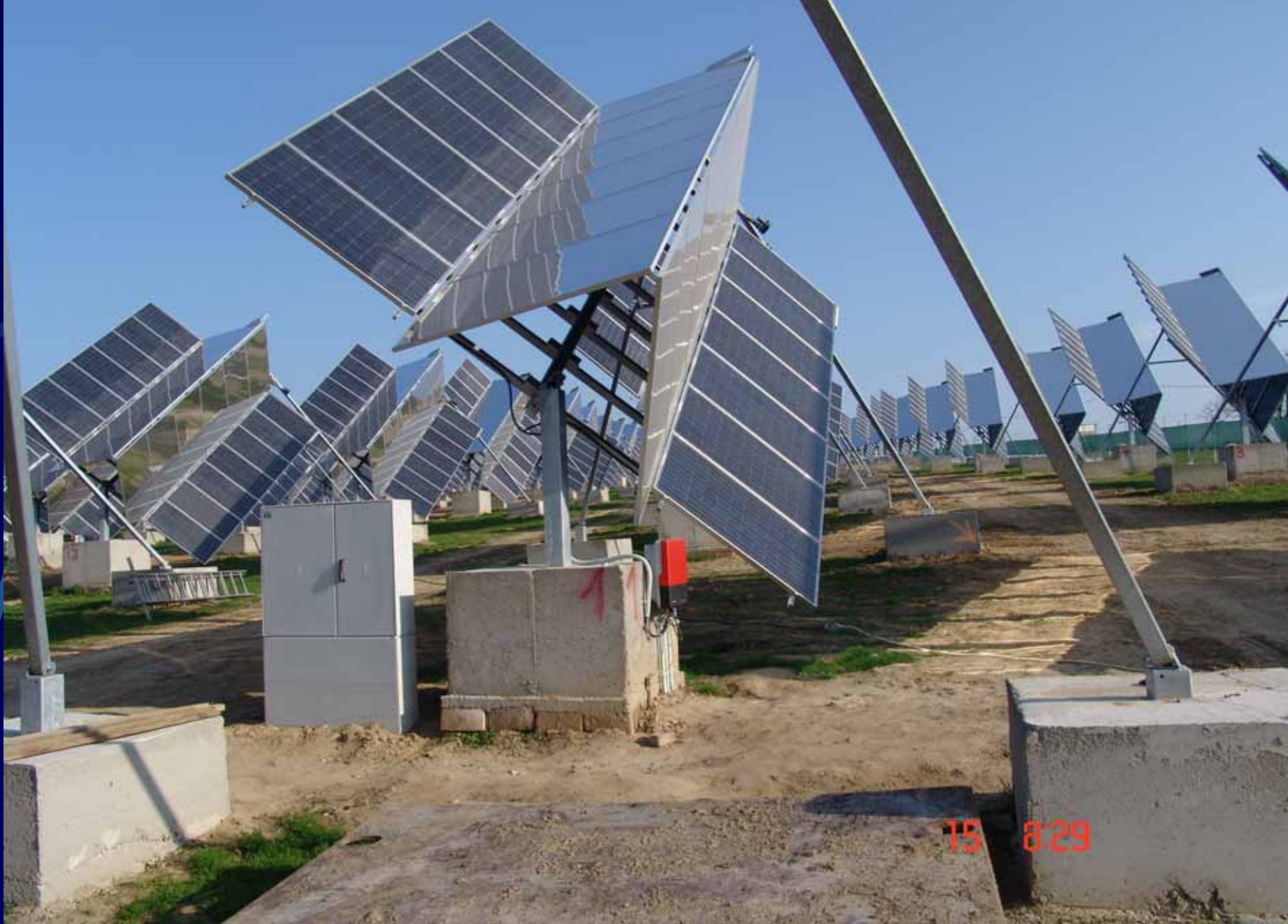
Tracking Ridge concentrator. Energy gain +60%