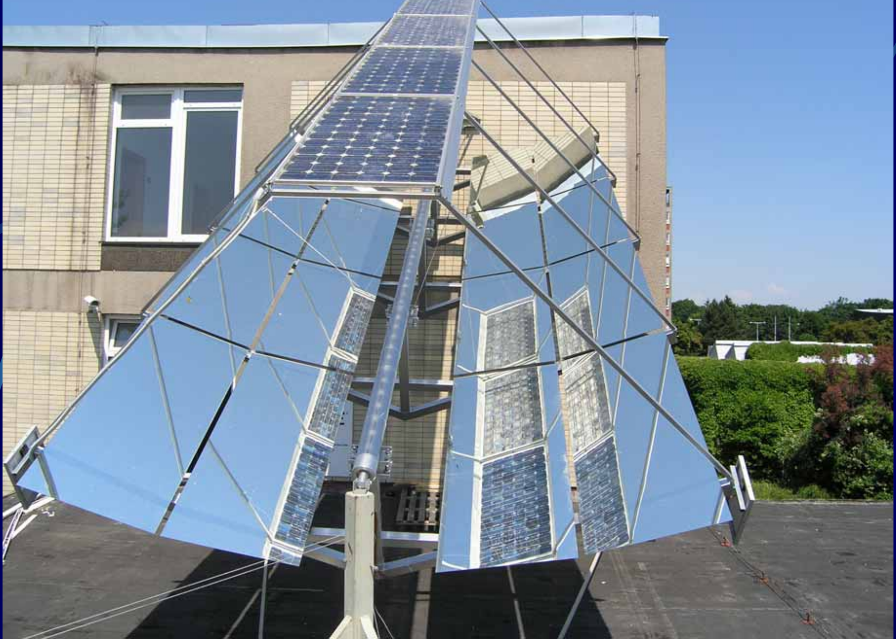
TRAXLE 5X concentrator 2kW with silicone gel laminated bifacial panels energy gain+185%